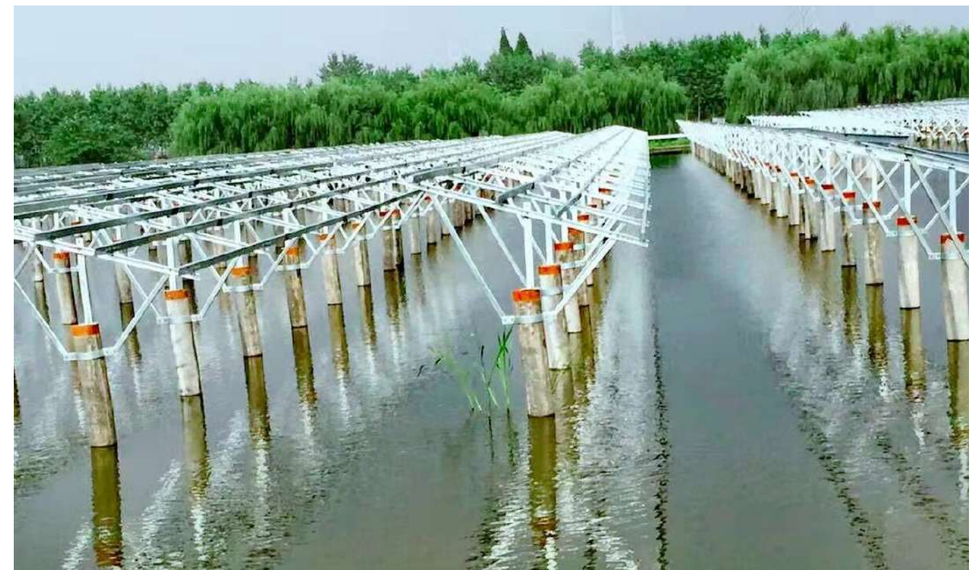
Project Reference 案例图